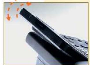
Fully adjustable display for a clear and comfortable viewing angle, from wherever you're looking.